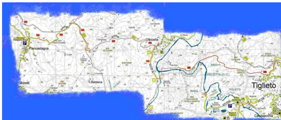
Map 4. The territory of Olbicella

the town of Varallo 9 (Italy – Piemonte –, now in the Province of Vercelli), in the Valsesia, situated at the confluence of the Mastellone torrent with the Sesia river, and the name of the Varàita torrent, that debouches into the Po river. The notion of ‘water’ in these cases is always present and, in particular, it is the concept of the ‘river water’ and of the ‘rain water’ that feeds rivers and torrents and that makes possible the life of the villages and of the towns that arise near the watercourses. So the meaning of ‘water’ is repeated throughout all the toponymic series of the loci that contribute to form the municipality of Urbe, as well as in the hydronym Orba and in the place name Olbicella .