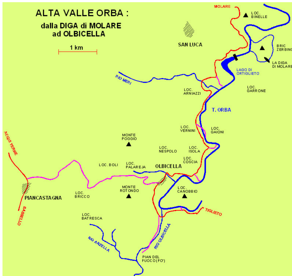
Map 2. The Upper Orba Valley, from the Molare dam to Olbicella

If we remain within the ambit of nomina linked to the root *albh- and to the meaning ‘water’, it may be interesting to remember that Albula was the ancient name of the Italian river Tevere (Tiber, Latin Tiberis ). Albiōn , the nomen of ancestral origin of Britain – from which we started in this reasoning –, denotes therefore the largest island on the English Channel, a locus situated on the water and surrounded by it.