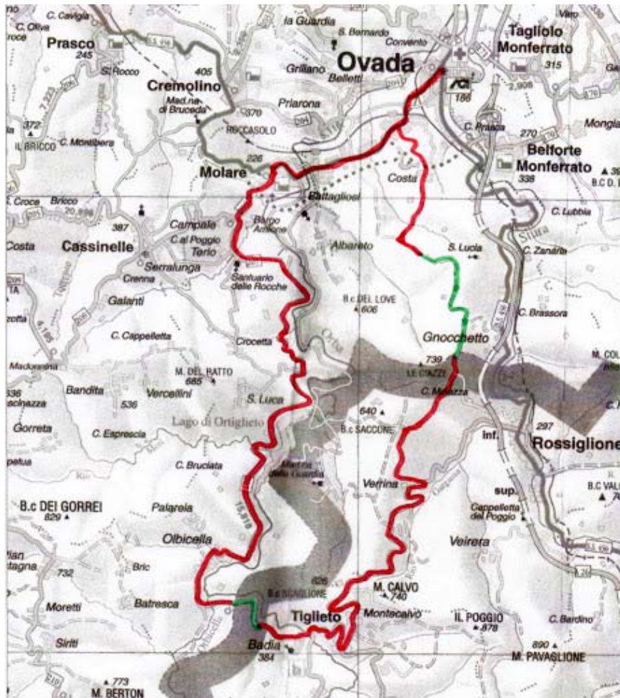
Map 1. Olbicella (coordinates 44°37'11"N 8°36'6"E) and the surrounding area

higher «size» than one individual or gentilitial property) to a proper name of a person of any origin, according to the possibilities offered by the historical and linguistic local stratigraphy, without even an attempt of comparison with names that, being verifiable – or falsifiable – on both «levels» of the «sign» (thus – even within the limits of verifiability of a geographical name – also on the semantic ambit, by definition excluded in the deonomastic formations, where the etymology is not relevant), would set the hypothesis at a higher epistemological level. The dictionary, however, provides an interesting indication about the reconstructed ancient form of the place name Olbicella : *Albicella .